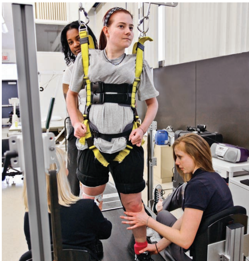
Kessler Institute for Rehabilitation and Kessler Foundation conduct many studies, and the new Model Systems grant will lead to further research to potentially help individuals with spinal cord injury regain motor function and improve their quality of life.